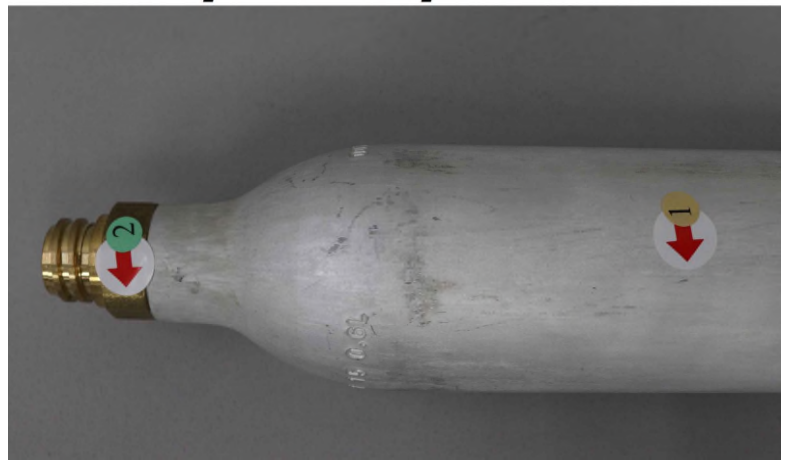
** 報告結尾 (End of Report) **